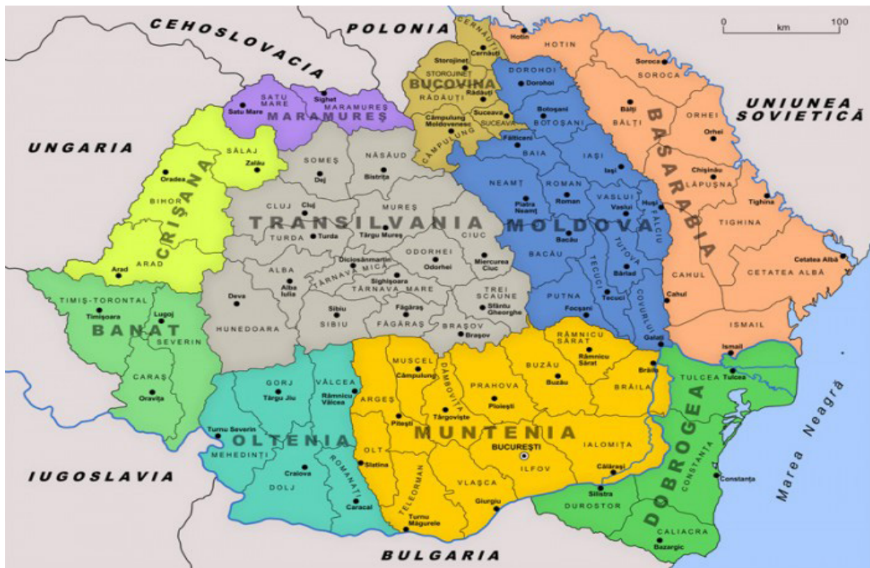
Fig. 1. Bukovina în the composition of Great Romania

Basically, during this whole reference period, the Ruthenian population present in the North-Bukovinian space at the beginning of the imperial authority began to grow fast and uninterrupted. Together with these realities we may add the attachment of the Hutsuls who mainly associated themselves with the Ukrainians, a process that was favoured by the orthodox faith of old style and by relatively consonant linguistic elements (UNGUREANU, 2003).